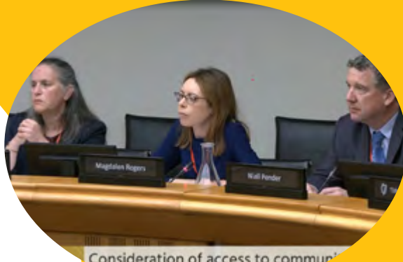
Consideration of access to communication teams

We maintain a very active and responsive communications platform across our websites and social media, as well as internally through our monthly e newsletters. We also work through partnership with other umbrella organisations, both within Ireland and at European level, to promote greater awareness and support for people living with neurological conditions.